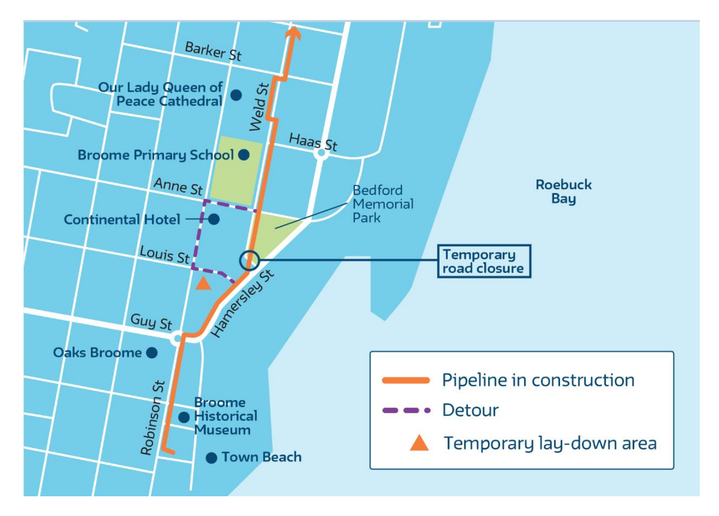
Map showing the wastewater pipeline in construction