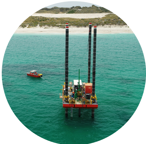
Offshore research ensures we minimise environmental impact