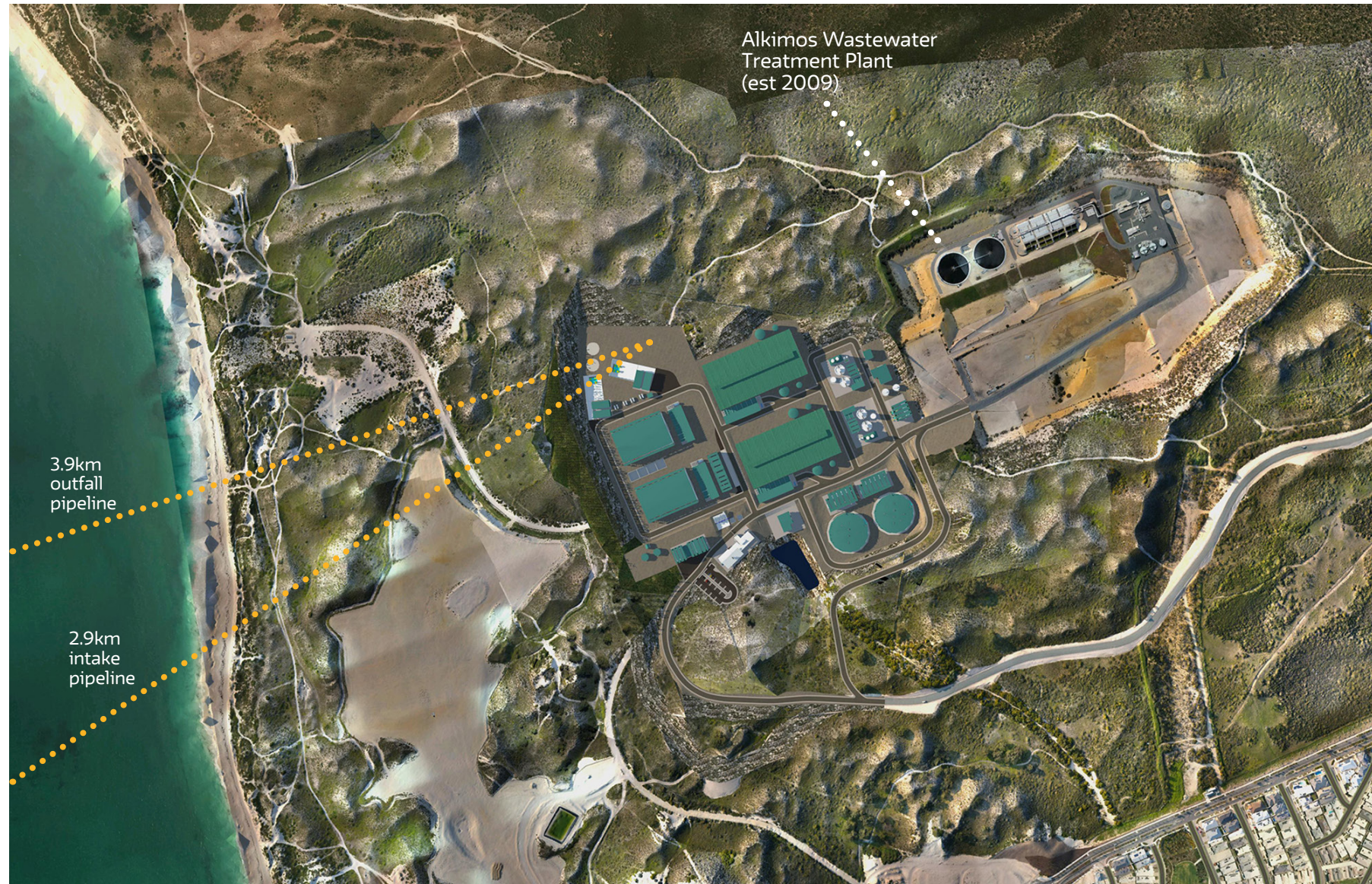
This concept view shows infrastructure for the Alkimos Desalination Plant built to operate at maximum capacity (100 billion litres per year).

Marine investigations have been undertaken using wave, current and wind monitoring. These concluded that environmental impact will be minimal when brine, which has a higher concentration of salt, returns back into the ocean via the outfall pipeline.