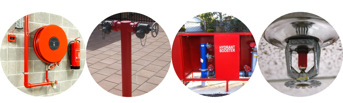
Fire hose reel, fire hydrant, hydrant booster cabinet and sprinkler

If the water network in your suburb is identified as suitable for streamlining, we will be in touch at least four months before work begins.