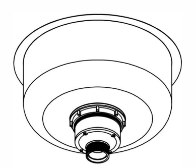
FIG3 f) Place basket back inside body