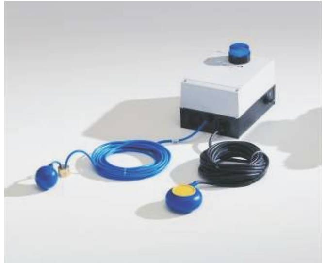
VISUAL ALARM & SENSORS

These are for commissioning and service purposes only. In normal day-to-day operations these controls do not need to be adjusted by the client.