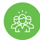
Personal and social capability