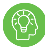
Critical and creative thinking