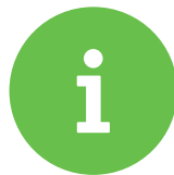
Information and communication technology (ICT) capability