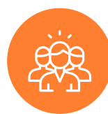
Personal and social capability