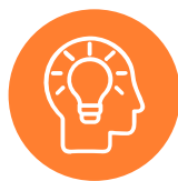
Critical and creative thinking