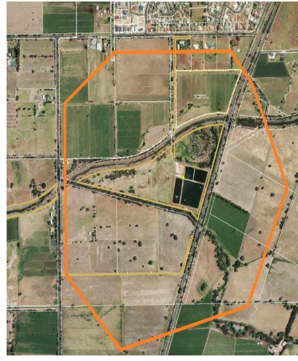
Figure 1 - A modelled odour buffer to a wastewater treatment plant