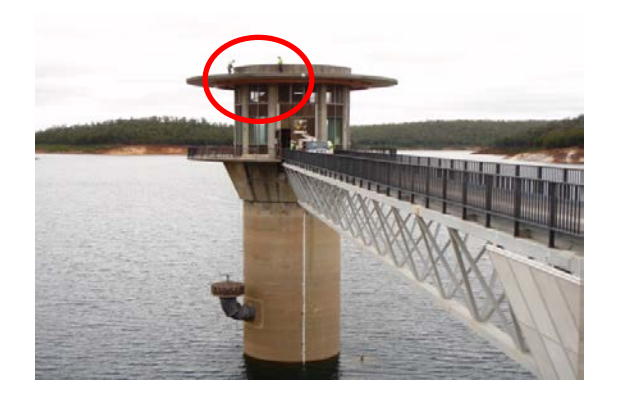
Photo 5 – Inspection of Intake tower in the Dam by conventional inspection approach.