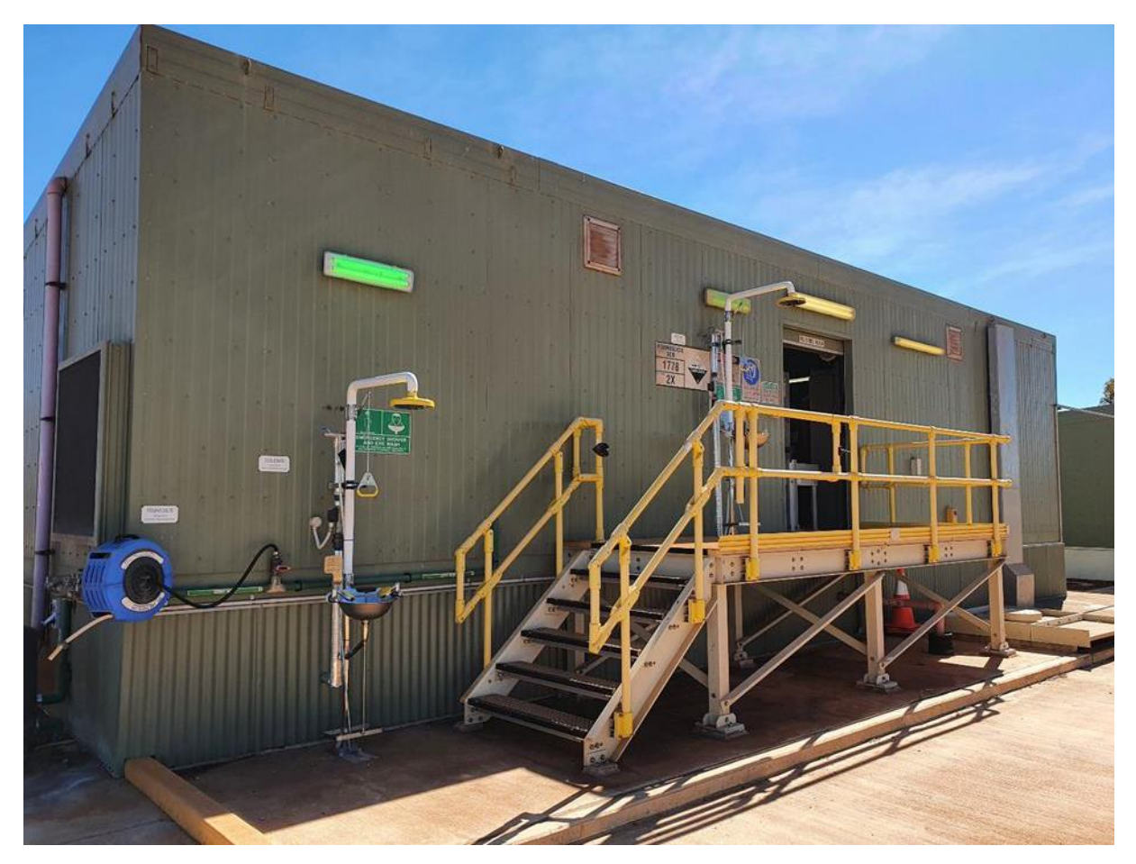
Figure 5-1: Continuation of raised platform outside roller door

The load-in panel shall be constructed from PVC sheet (nominally 12 mm thick) with FRP frame and supports. It shall have a drip tray which runs the full length of the panel and extends well clear of the valves and transfer point mounted on the panel to collect any drips. The tray shall have additional side and bottom supports to prevent cracking of PVC welds due to the weight of the hose and operator. The front of the tray shall have a rolled over reinforced edge to act as an intermediate support for the transfer hose. The drip tray shall be graded towards a drain that is piped to the bund sump and made from material compatible with both the delivered strength and diluted strength of the chemical (e.g. Sulphuric Acid is a particular issue due to heat of dilution as well as change in corrosivity).