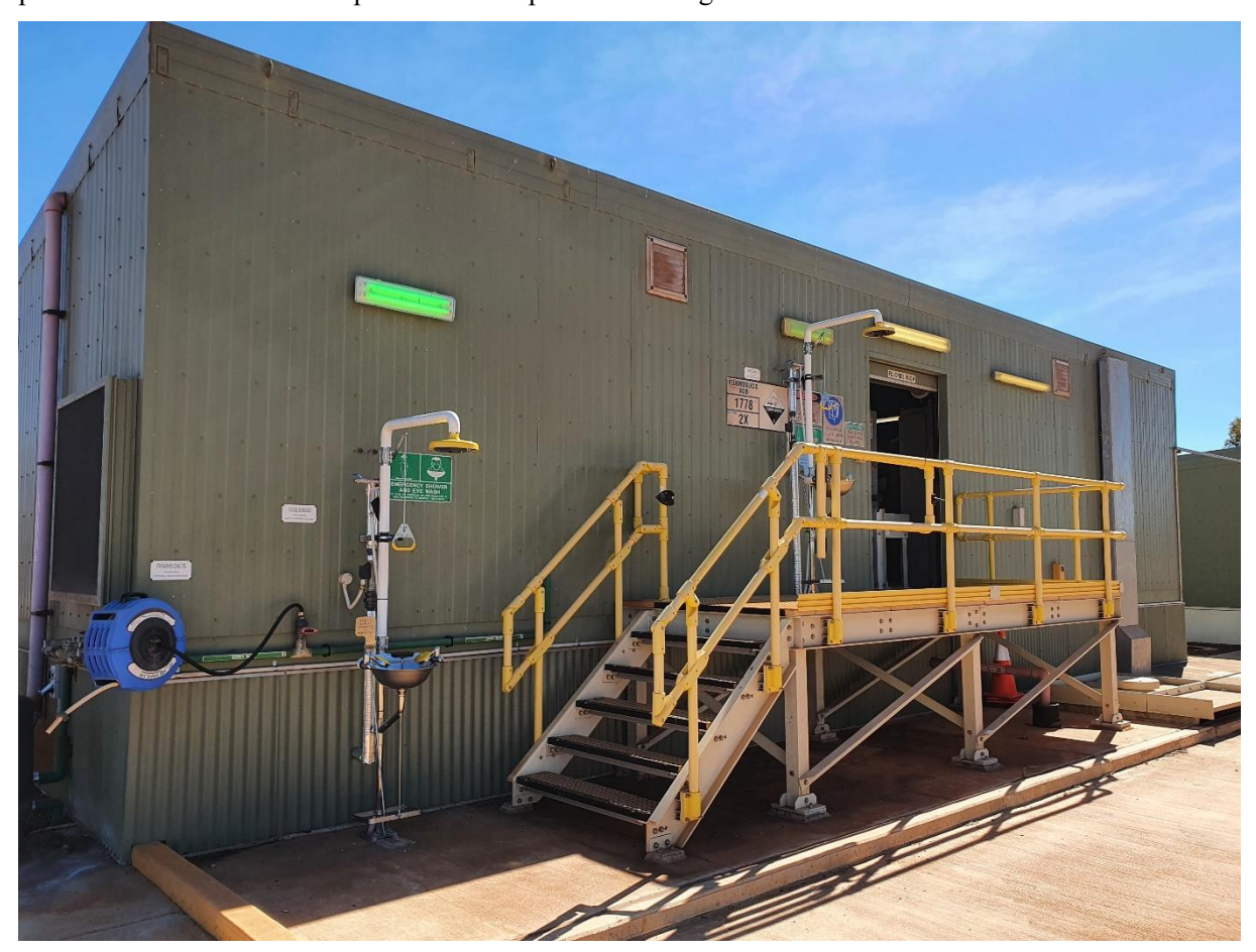
Figure 4-1: Example of a raised load-in platform

Depending on the delivery requirements, chemical load-in panels may have to be located on an elevated platform so that any residual chemical in the flexible hose after transfer will drain back to the tanker. This has not been a requirement for current sodium hypochlorite delivery as the hose is air purged at the end of the unloading. However, this should be confirmed before the design work is carried out. The photo below shows an example of a raised platform configuration.